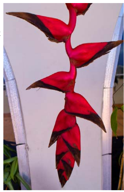
A beautiful inflorescence of Heliconia necrobracteata on display.