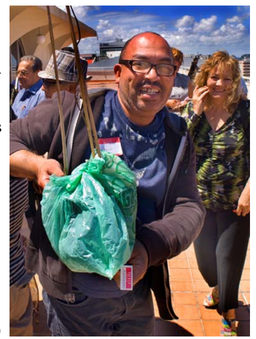
A happy winner of the HSPR Raffle!